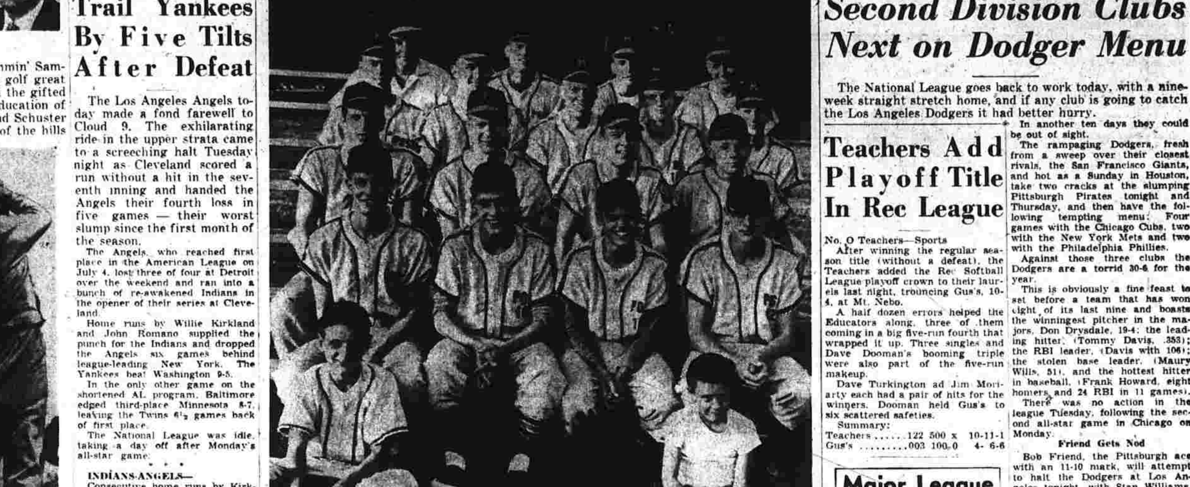
The Los Angeles Angels today made a fond farewell to the Los Angeles Angels to a cheering fan throng...